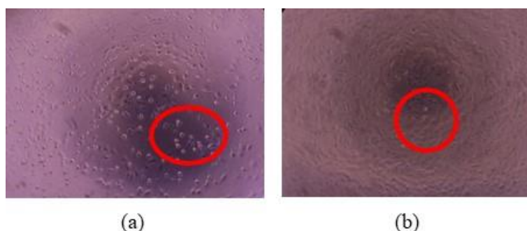
Figure 2. Effect of fraction 4 treatment on T47D cells. (a) Normal cells, (b) 5 µg/mL.