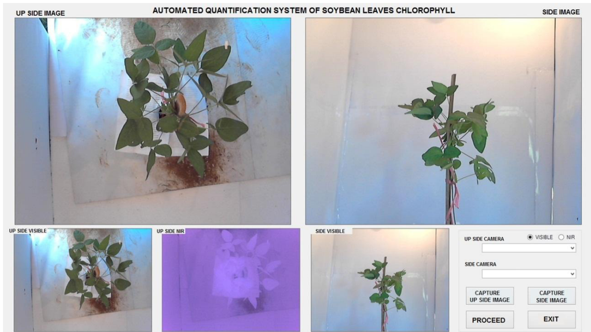
Fig. 1. Graphical User Interface (GUI) for Multispectral Image Acquisition

The NDVI image was then segmented using Otsu algorithm for separating the object with the background automatically. After that the process continues with erosion threshold operation. Erosion threshold was the image processing methods that used to shrink the area of the object so that it could remove noise (confounding objects) which interfere with the desired object. After erosion threshold process continues with dilation operation. Dilation was a method to grow or thicken object area. The last stage was cropping operation to eliminate confounding objects that cannot be removed by erosion and dilation operation. The process of cropping was done by cutting (changing the object color from white to black) in certain parts of the drawing area. The next stage was leaf area quantification. One pixel in the image represented 0.25 \text{ cm}^2 ( 0.25 \times 10^{-4} \text{ m}^2 ) of the actual size. The object that was used as a comparison was a meter ribbon. Leaf area were calculated with automation systems that were tested for accuracy by comparing the results of predicted leaf area with the manual colored leaves.