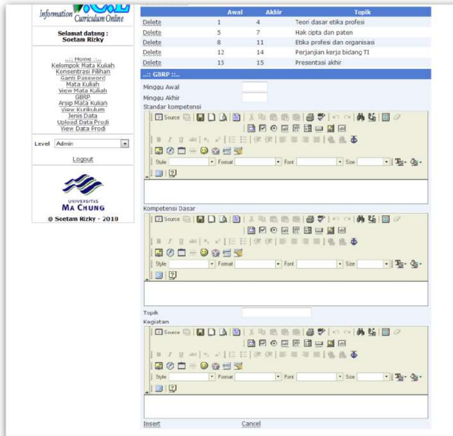
Figure 4. Sample of document creation page

At last, as a final result for this system, as mentioned previously, the collaborative documents result can be accessed easily and more convenient for accreditation team member in order to fasten the borang filling process. All of the documents which already being verified and also categorized using accreditation standard can easily downloaded and printed by the team members, thus it can produce efficient workload and increase productivity as its purpose. The following two figures show how the accreditation team can access the result from the system.