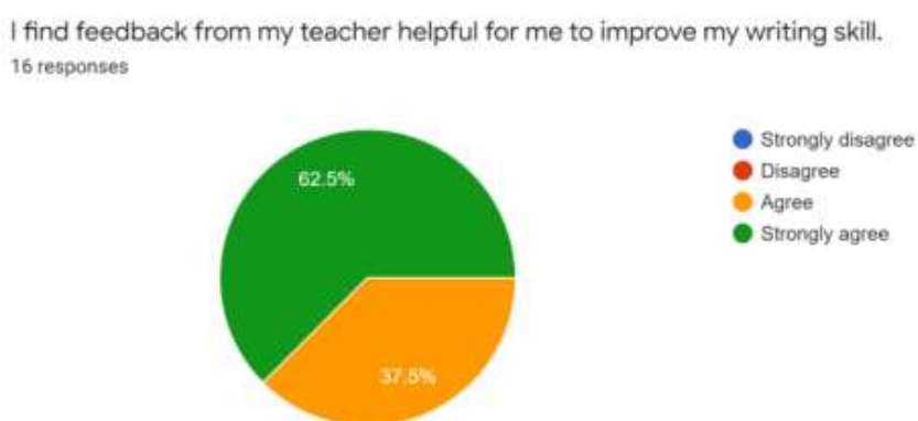
Figure 4. 4

students like this repetitive practice model. They get a chance to revise their article before the instructor marks it. In this study, the researcher found that 62.5% said they strongly agree that the three methods help them make sound academic essays. Meanwhile, 37.5% said that they enjoyed the instructor's feedback technique.