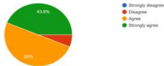
Figure 4. 1

I enjoy learning a flipped class model in essay writing class (watching a movie, making up an essay, getting feedback from friends, and the teacher). 16 responses