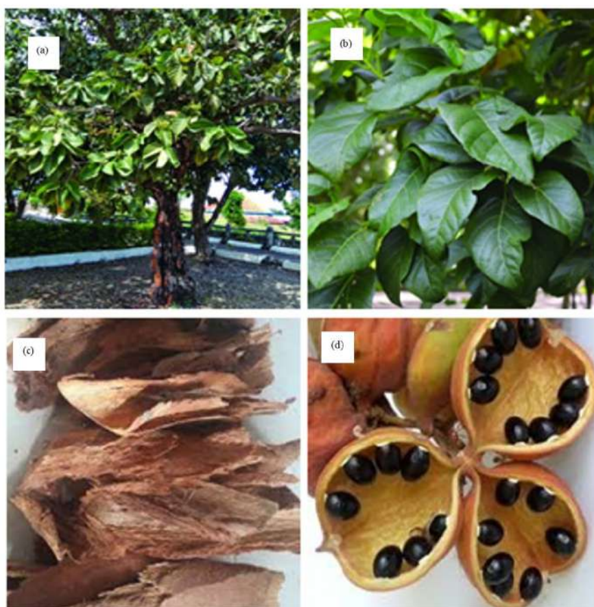
Fig. 2(a-d): (a) S. quadrifida R.Br. trees, (b) leaves, (c) bark, (d) fruits and seeds

The S. foetida L. known as "Nitas" (Fig. 3a-d) is one of the plants in the East Nusa Tenggara region that belongs to the Sterculiaceae family 6 . The S. foetida collection in the Kupang research (Fig. 1) and development environment forest originates from North Sulawesi. In Indonesia, this plant is spread in several areas including Sumatra, Java, Bali, Lombok, Sumbawa, Flores, Timor, Borneo, Sulawesi, Maluku and Irian Jaya 7 .