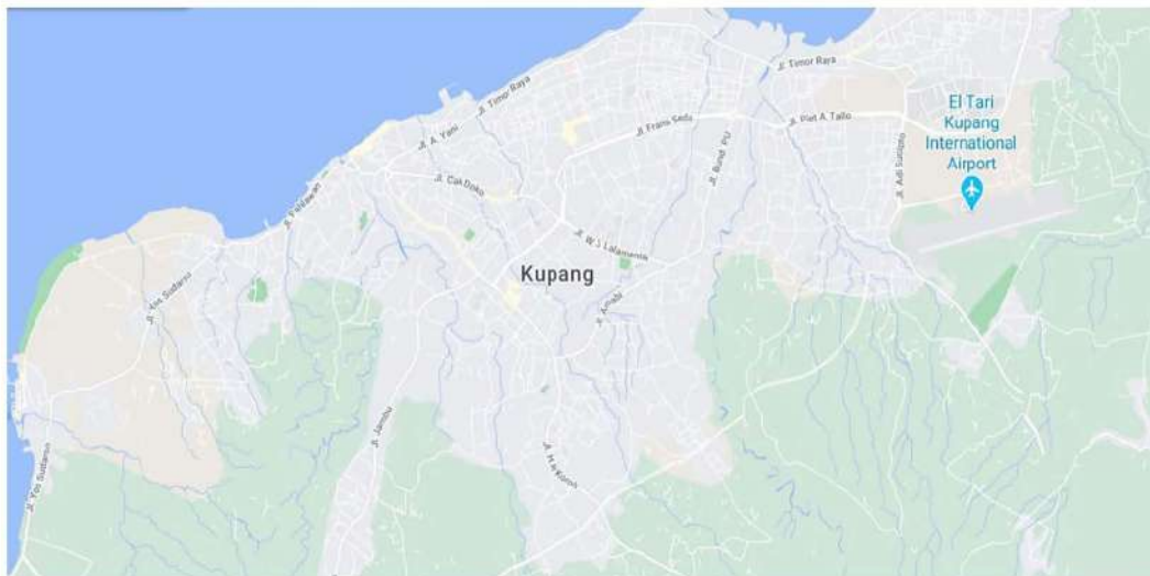
Fig. 1: Map of S. quadrifida and S. foetida sampling location in Kupang, East Nusa Tenggara 4