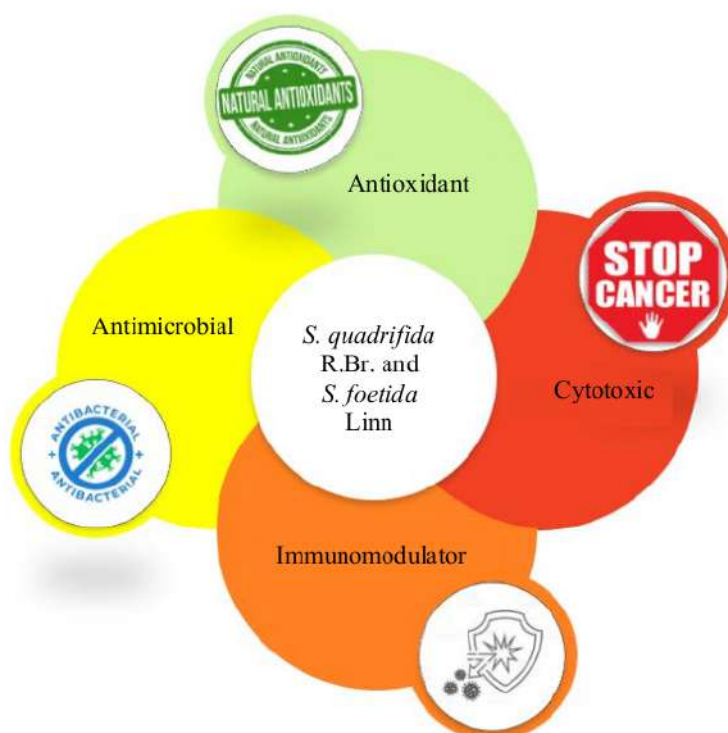
Fig. 4: S. quadrifida and S. foetida Linn. shown exert biological activities interesting for human health

The use of S. quadrifida and S. foetida and its properties are discussed in Table 1, such as antioxidant, antimicrobial, immunomodulator and cytotoxic activities.