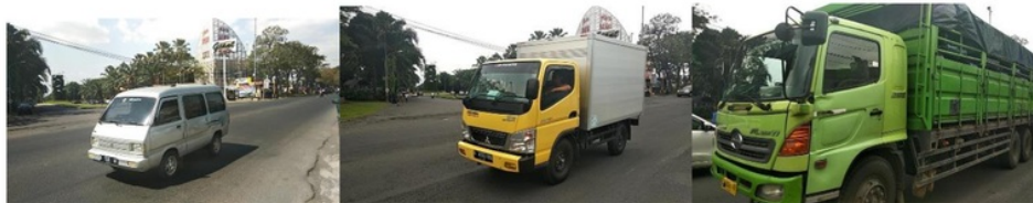
Figure 2. Examples of out-sample data. Left-right: group 1, group 2 dan group 3 vehicle

The second evaluation is using out-sample data. This evaluation was conducted to verify the accuracy of the CNN network in the first evaluation. Evaluation was carried out using 150 vehicle images with the distribution of 50 images for each group. All evaluation data that will be used are new images that are excluded in the training process. The out-sample data is obtained by taken photo directly on the road. Examples of out-sample data are shown in the Figure 2.