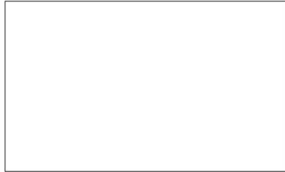
Figure 3. The sample of objective writing prompts in PIS.

Note. PIS = partially implementing school.