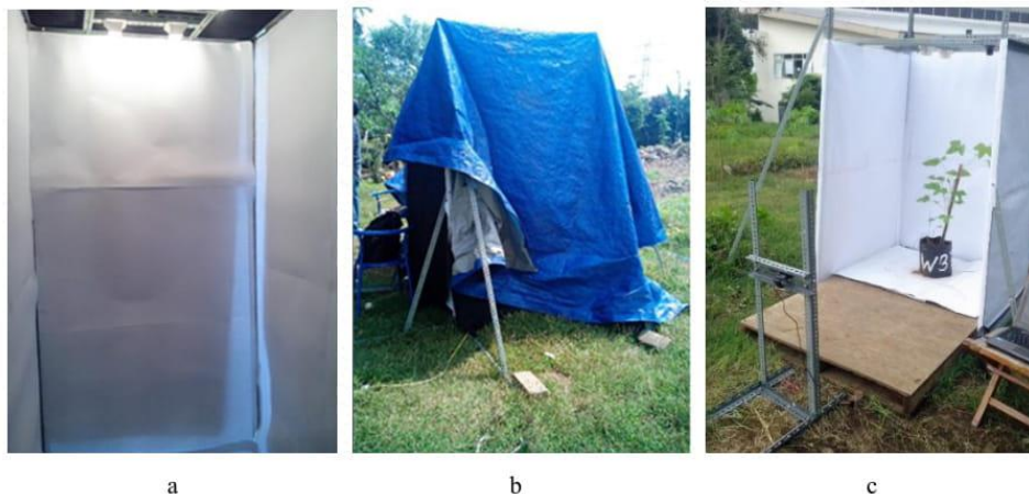
Fig 2. (a) Inside area of image acquisition box; (b) outside area of image acquisition box; (c) soybean plant inside image acquisition box.

provide accurate prediction of leaf area value. After leaf area measurement process continues to quantification of the average NDVI values, which compared its accuracy with Konica Minolta SPAD-502 chlorophyll meter. SPAD-502 chlorophyll meter value has strong relationship with total chlorophyll concentration on the plant leaves. The method was to mark one of the leaves with a paper sticker as reference point for SPAD and NDVI value measurement. The result of SPAD measurement was then compared with the results of the NDVI at the marked point. The result of the calculation is then displayed in the form of correlation and regression. The results showed a correlation p-value of 0, and the correlation value of 0.837. Regression showed a good value with r-square of 0.70. Regression results can be seen in Fig. 4. It can be concluded that the value of NDVI values in line with the SPAD value, not by the variation of the data. For leaves colored dark green that has a high SPAD values, can also be predicted to have a high NDVI value anyway. Vice versa, when the leaves turn yellow and SPAD value is low, predictable NDVI values are low as well.