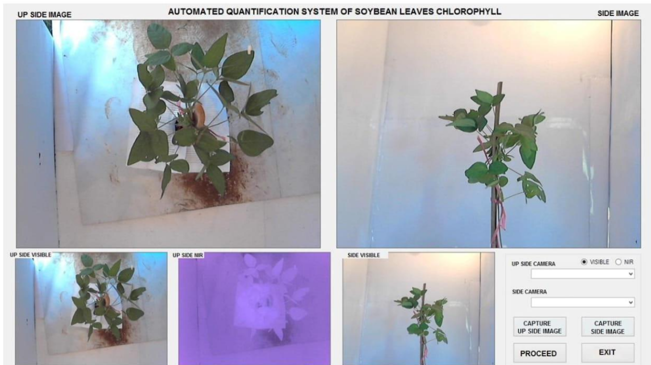
Fig. 1. Graphical User Interface (GUI) for Multispectral Image Acquisition

The NDVI image was then segmented using Otsu algorithm for separating the object with the background automatically. After that the process continues with erosion threshold operation. Erosion threshold was the image processing methods that used to shrink the area of the object so that it could remove noise (confounding objects) which interfere with the desired object. After erosion threshold process continues with dilation operation. Dilation was a method to grow or thicken object area. The last stage was cropping operation to eliminate confounding objects that cannot be removed by erosion and dilation operation. The process of cropping was done by cutting (changing the object color from white to black) in certain parts of the drawing area. The next stage was leaf area quantification. One pixel in the image represented 0.25 \text{ cm}^2 ( 0.25 \times 10^{-4} \text{ m}^2 ) of the actual size. The object that was used as a comparison was a meter ribbon. Leaf area were calculated with automation systems that were tested for accuracy by comparing the results of predicted leaf area with the manual colored leaves.